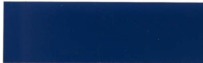
Regal Blue (RU)