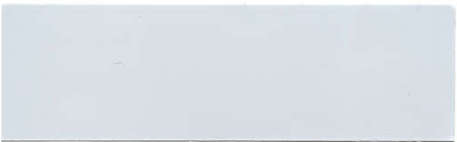
Regal White (WK)