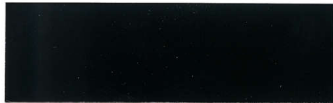
Matte Black (BL)