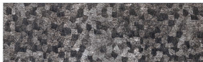
Galvalume (GL) (Not Painted)

Since all color chips are affected by age, lighting conditions, heat and mechanical processes, the chips on this card may vary slightly in color or finish from actual panels. Consult factory for other colors and finishes.