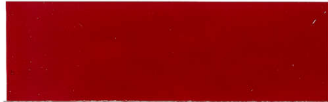
Ultra Brite Red (UB)